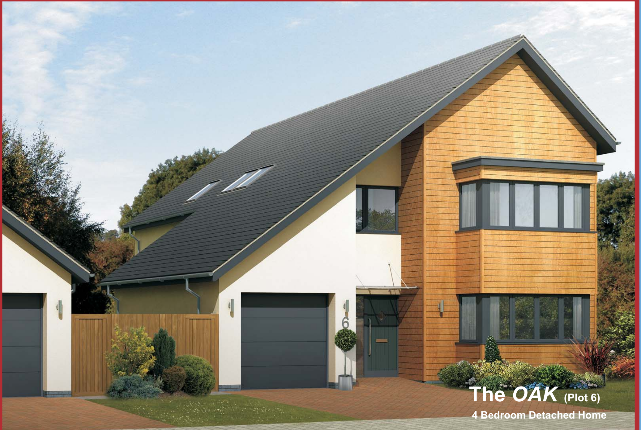
The OAK (Plot 6) 4 Bedroom Detached Home