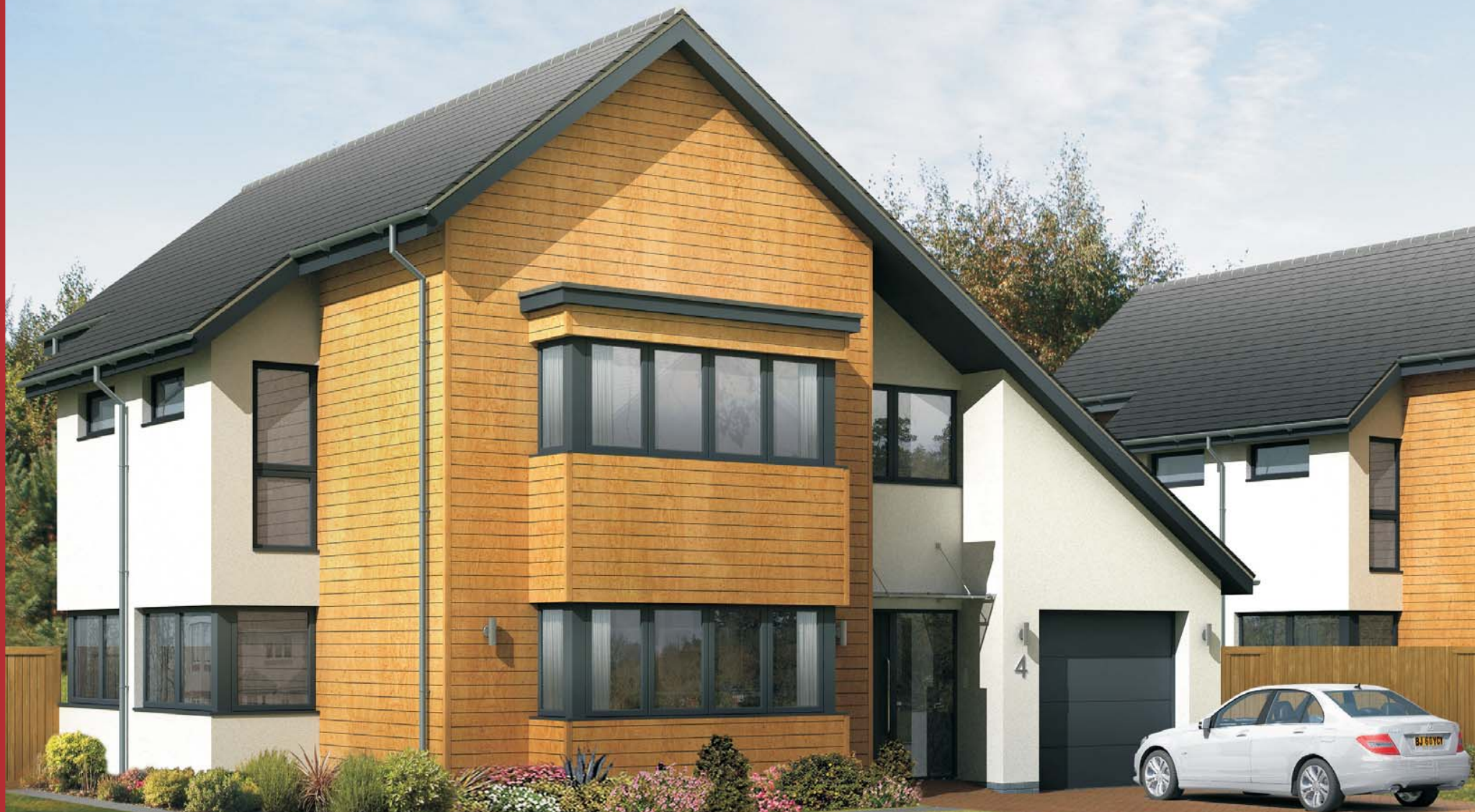
The ELM (Plot 4) 4 Bedroom Detached Home